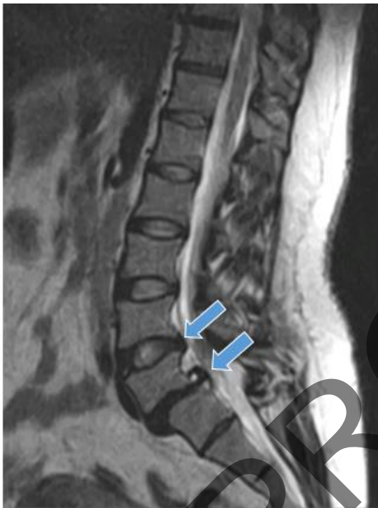
Figure 1. Example of HIZ (arrow) in T2-weighted MRI sagittal images for one of the patients

fibrosus on T2-weighted MRI and surrounded by the low-intensity signal of the annulus fibrosus [22]. Figure 1 represents an example of HIZ in one T2-weighted slice for one of the patients. The criteria for an HIZ included a high-intensity signal located in the posterior annulus fibrosus, clearly dissociated from the signal of the nucleus pulposus and appreciably brighter than that of the nucleus pulposus. To better diagnose annular tears against the calcified tissue, both T1- and T2-weighted images were evaluated.