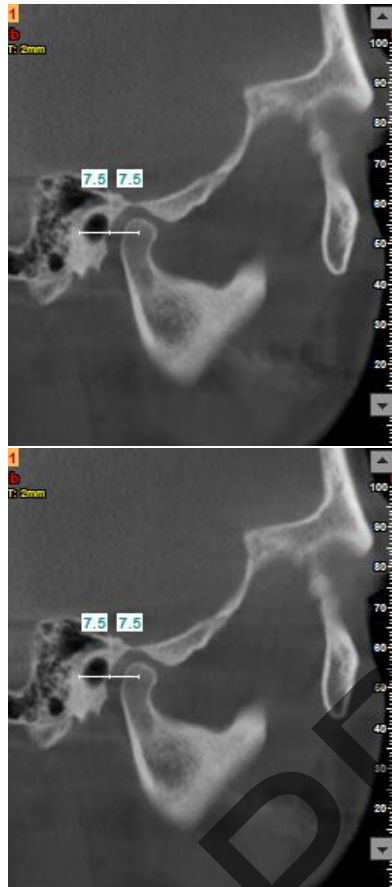
Figure 1. Measurements in sagittal sections; APC (Upper) and VPC (Bottom)

The Vertical Position of the Condyle (VPC): the vertical distance between the center point of the condyle and the EAM.