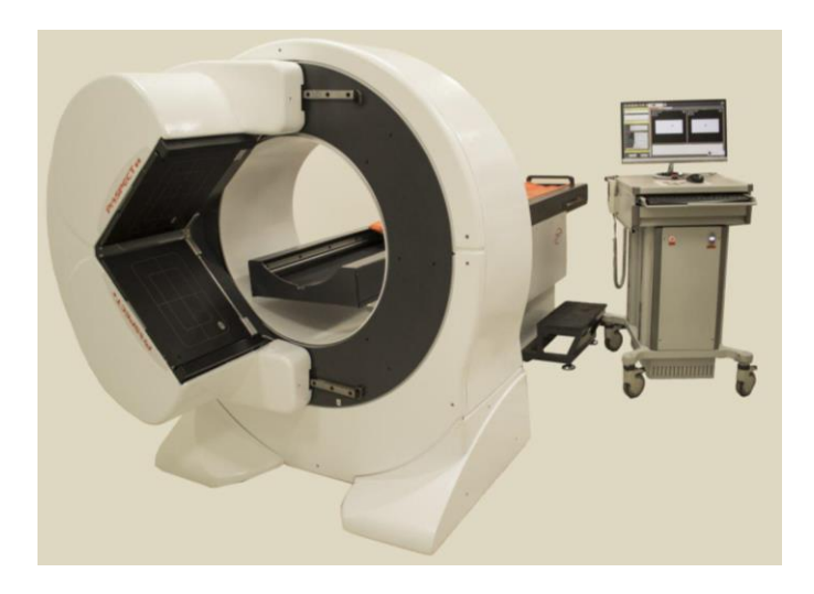
Figure 1. The ProSPECT system

Association) standard with number of NU-1:2007 regarding to gamma camera [22].