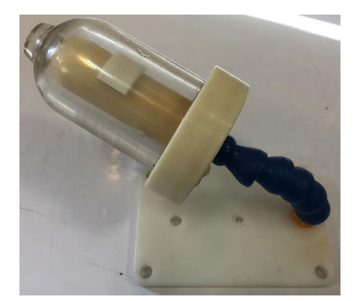
Figure 2 . An in-house heart phantom to assessing image quality of the ProSPECT system

The phantom was filled uniformly with 500 uCi Tc<sup>-99m</sup> dissolved in normal saline to acquire the image. Then the phantom in both supine and prone mode of scan with routine acquisition parameter including 90 arc scan, 16 numbers of views, 25 sec time per view and dual head mode. Also the two acquired images were reconstructed using the MLEM method with 6 iterations and 4 subsets and with Butterworth post filtering (10 orders, 0.37 cut-off frequency).