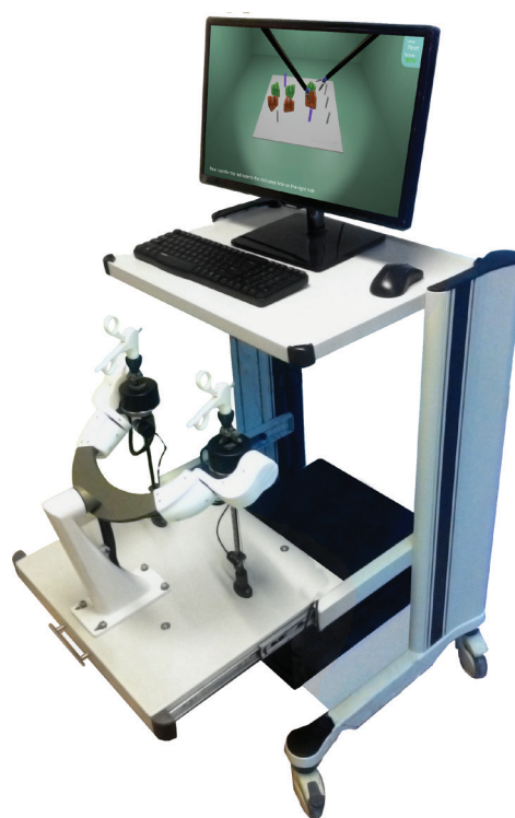
Figure 1. The SinaSim laparoscopic surgery simulator [10].

A microprocessor uses position sensors to measure the state of each degree of freedom to fully define an instrument's position and orientation in its state space. Each instrument has five degrees of freedom including: pitch, yaw, roll, insertion and grasping which each of them connected to a position sensor independently. All of these sensors are connected to the microprocessor installed on the bottom of the moving mounting which communicates with computer through a single USB port.